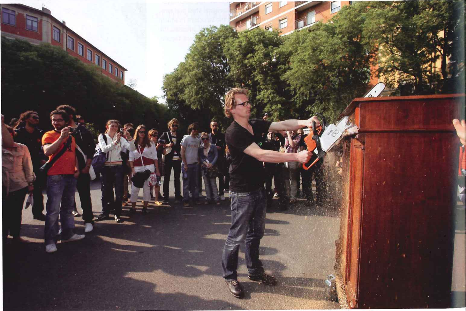
Left The cupboard now functions as a working bar Below At the moment Rolf's main focus is redesigning furniture Opposite page New and old elements are fused to make a modern piece

"I am far less concerned with decoration and ornamentation. By cutting a classic piece of furniture in half, I bring to the surface the bones of the original piece"